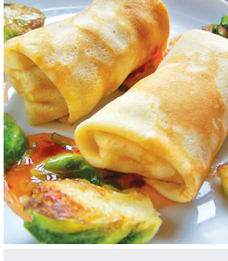
< ROAST PORK CREPES ^