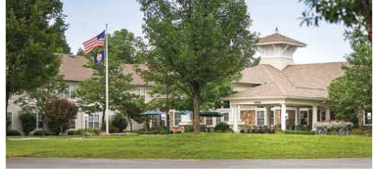
Legacy at Park Crescent in Greece 585-865-0680 INDEPENDENT LIVING • ASSISTED LIVING ENHANCED ASSISTED LIVING • MEMORY CARE