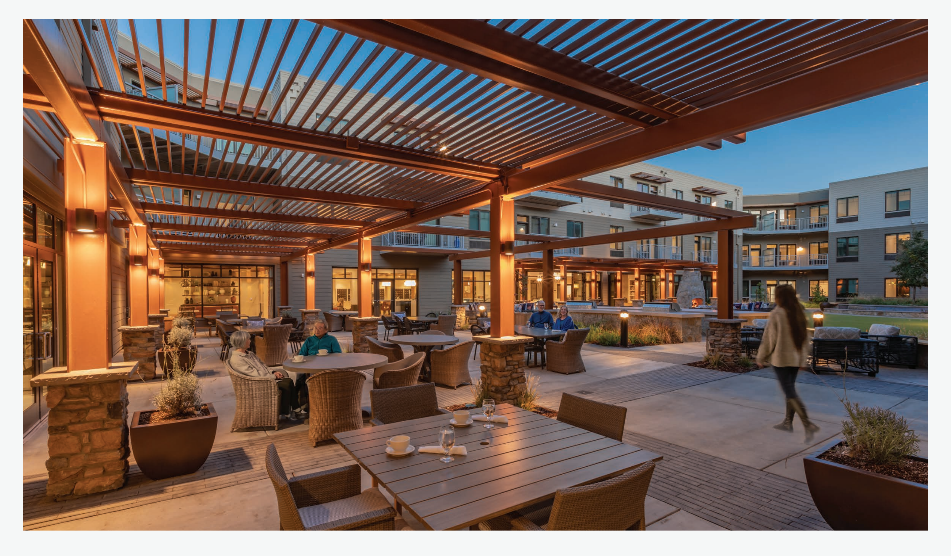
NAPA VALLEY FEATURES STYLISH RESIDENCES, WORLD-CLASS DINING, AND ENDLESS OPPORTUNITIES FOR LIVING AN ELEVATED LIFE, RICH IN EXPERIENCES