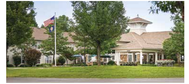
Legacy at Park Crescent in Greece 585-865-0680 INDEPENDENT LIVING • ASSISTED LIVING ENHANCED ASSISTED LIVING • MEMORY CARE