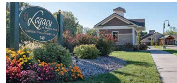
Legacy at Maiden Park in Greece 585-546-7275 ASSISTED LIVING • ENHANCED ASSISTED LIVING MEMORY CARE