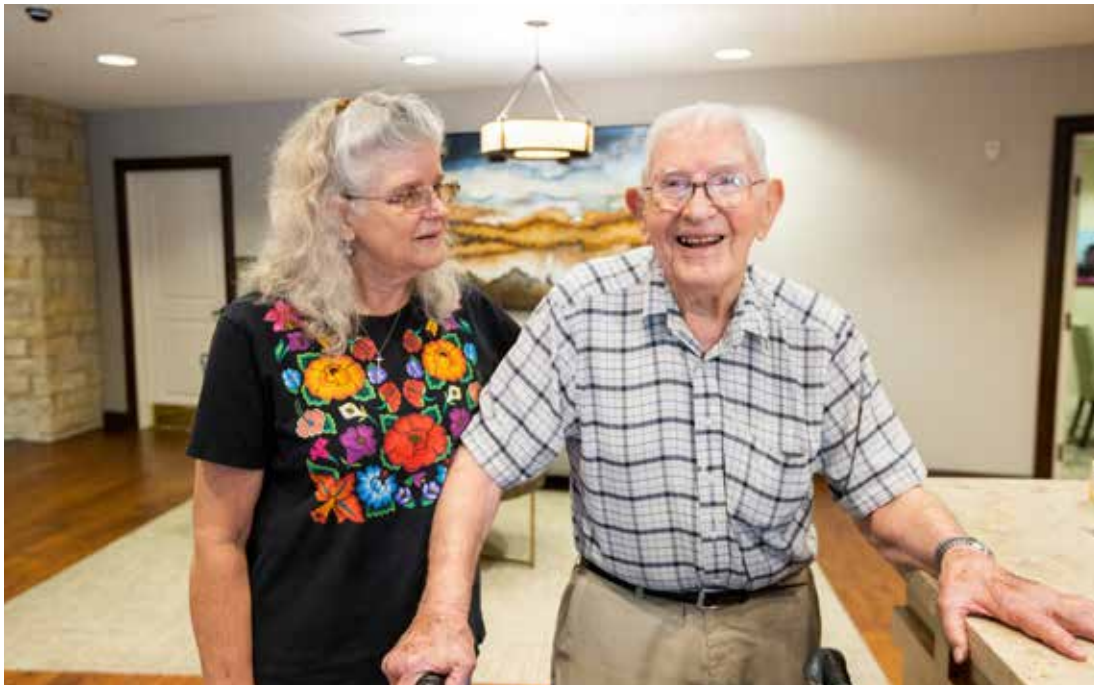
Personalized attention helps people pursue passions and stay healthy.