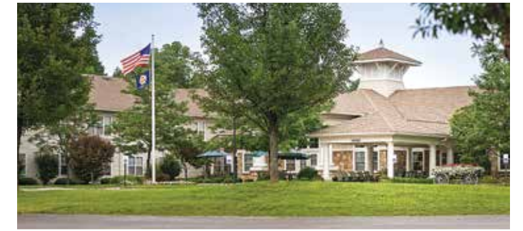
Legacy at Park Crescent in Greece 585-865-0680 VILLA LIVING • INDEPENDENT LIVING