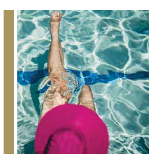
We are not what you'd expect and that's precisely the point.

The Watermark difference is not just about where you live – it's how you thrive. It's an environment enhanced with countless opportunities to help you grow, explore, and feel your best every day.