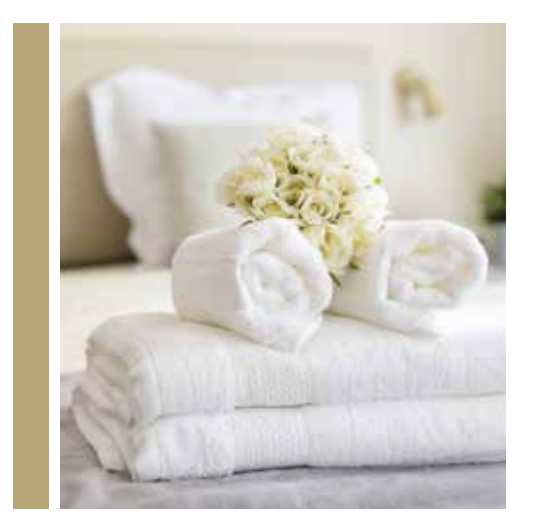
We take care of everything so you can thrive.

With a variety of bright and spacious studios, onebedroom, and two-bedroom residences to choose from, you'll find the right space to call home. When you're ready to move, take advantage of our movein coordination services with professionals to help you navigate the whole process. And if you'd like a helping hand now and then, you can request personalized services delivered right to your door.