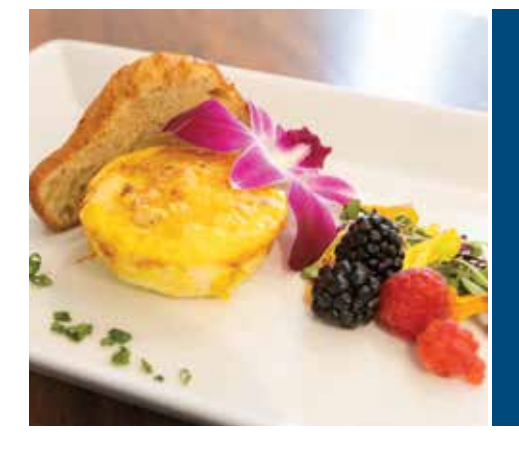
The chef is great and the food is very good. We enjoy when he comes out and socializes with us. The servers are wonderful as well.

Our ever-changing menu features everything from gourmet selections to comfort foods. Each meal is crafted with intention by our culinary team to be both healthy and delicious. And with Gourmet Bites Cuisine you have the option to transform menu items into hand-held creations to enjoy without assistance, utensils, or distractions.